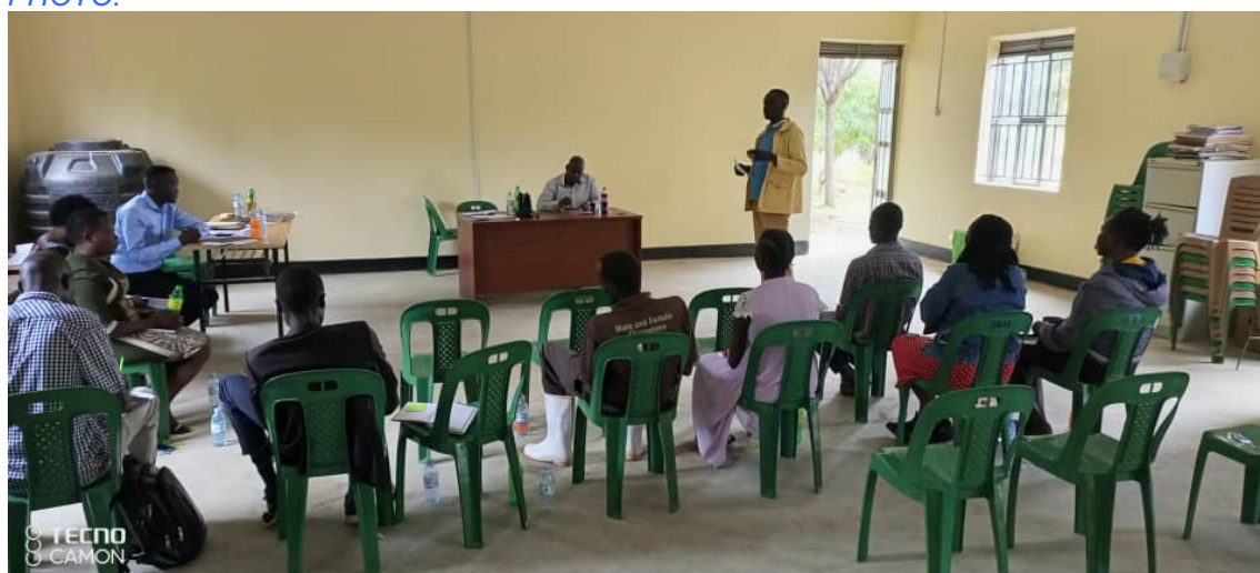
Youth councillor to the district addressing stake holder in the inception meeting..