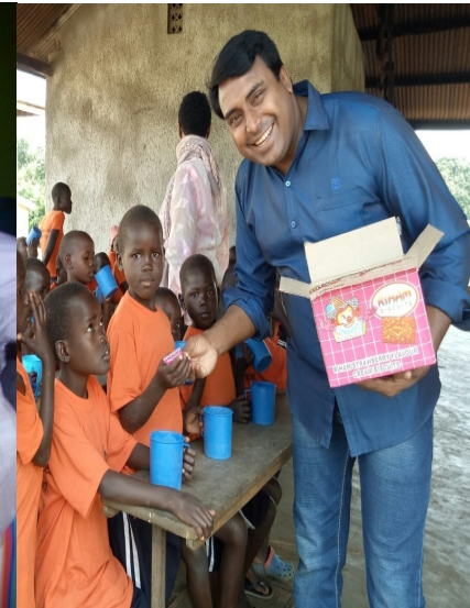
feedings school children