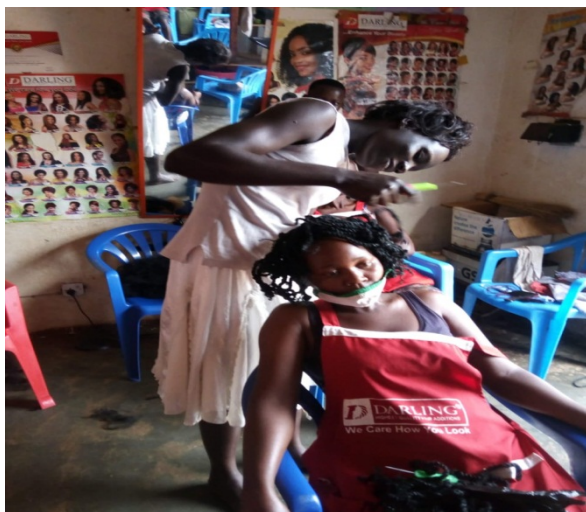
HAIR DRESSING TRAINING TO YOUNG GIRLS DONATION TO KOLE DISTRICT