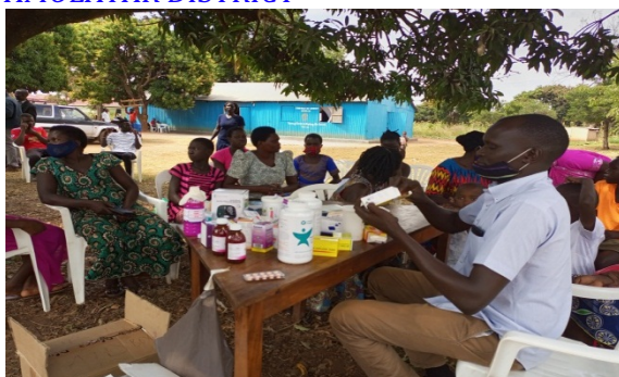
MEDICAL CAMP, TREATING THE COMMUNITY CITY