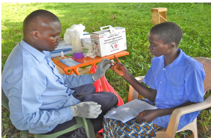
checking for th HIV Health status

Since January 2021, SEVAC Foundation Uganda has together with other CSOs under their framework engaged in the discussions of the Local government service delivery. Five lobbied meetings were organized with the District to discuss CSOs input and the District accountability to poor service delivery to the local people. Through the support of Vitamin Angels, SEVAC Foundation Uganda has been able to administer De-Worming and Vitamin A to over 500000 children of ages 6-59 months in Lira, Otuke, and Amolatar district, signed mou with government through ministries of gender, labour and social development, a member of lango nutrition technical working group, a member of Uganda nutritional technical working group.