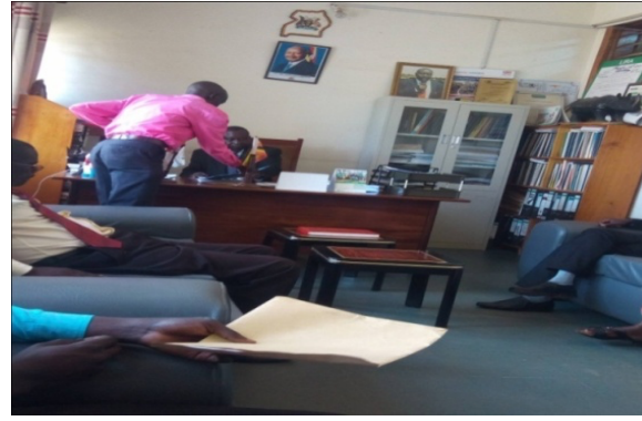
signing MoU with lira district 2018