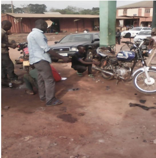
Imparting skill work

Providing education and health to the most underprivileged children in Northern Uganda. We believe that children are future assets and taking care of them is taking care of our future. Right Photo: Children less than five (5) years receive de-wormers and Vitamin A supplements in Nursery schools, Lira District- Support of Vitamin Angels USA