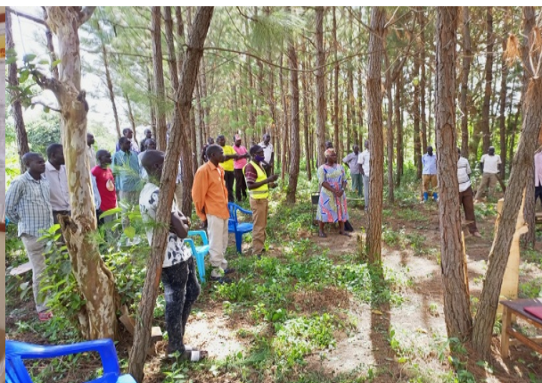
TRAINING FARMERS IN OYAM ON TREE PLANTING