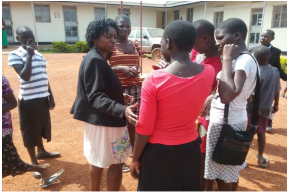
Netherlands coordinator with student