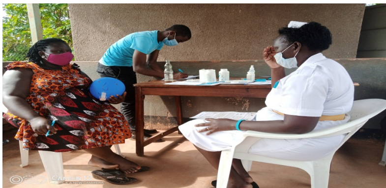
NURSES ATTENDING VITAMIN TRAINING HEALTH CENTER