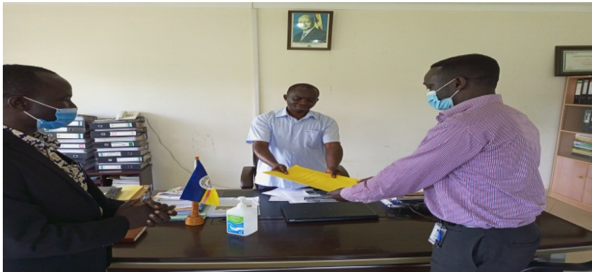
Handing over MOU with government to chairperson Amolatar district