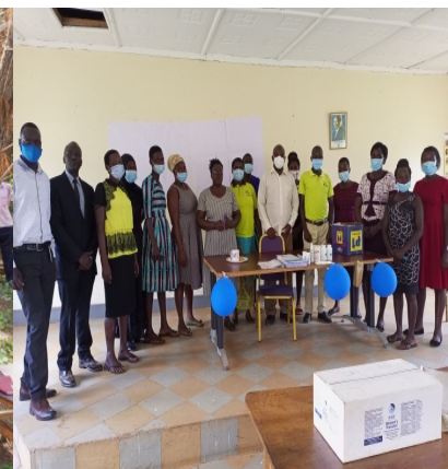
TRAINING HEALTH WORKERS IN AMOLATAR DISTRICT