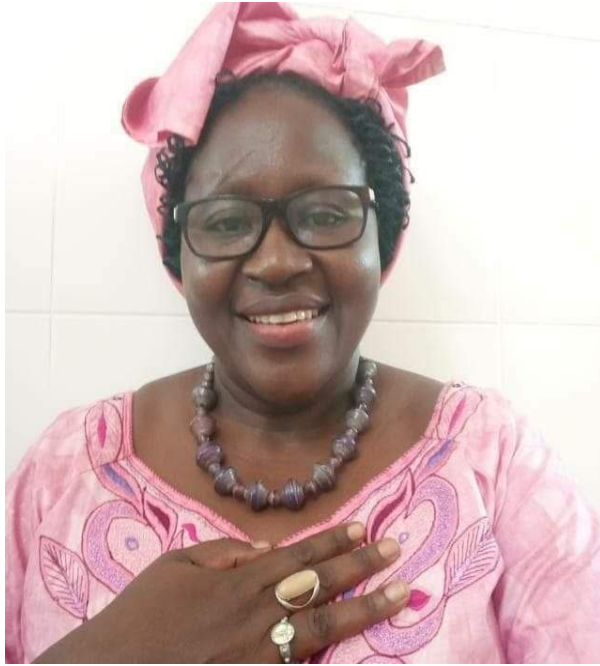
Hon. JUDITH ALYEK, PATRON MEMBER OF PARLIAMENT