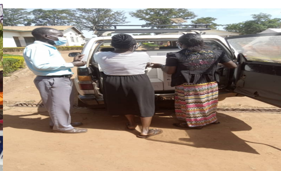
DONATION TO LIRA REFERRAL HOSPITAL