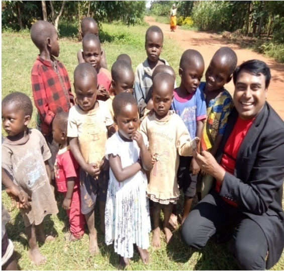
Helping vulnerable children