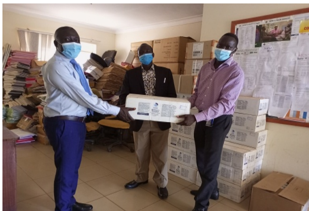
DHO AMOLATAR DISTRICT RECEIVING MMS AMOLATAR DISTRICT