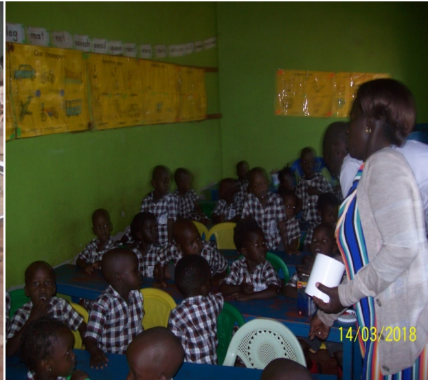
vitamin administration in various school