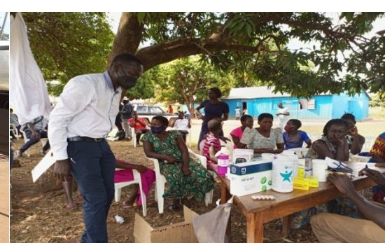
TREATING THE COMMUNITIES IN LIRA