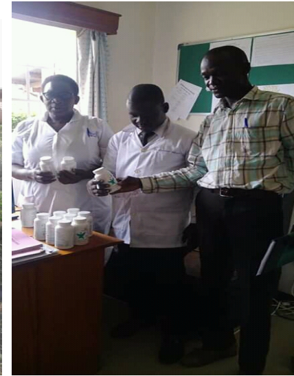
Giving vitamin to health centre, LIRA