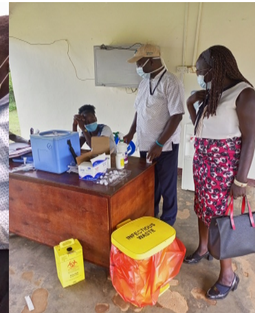
MONITORING ADMINISTRATION OF