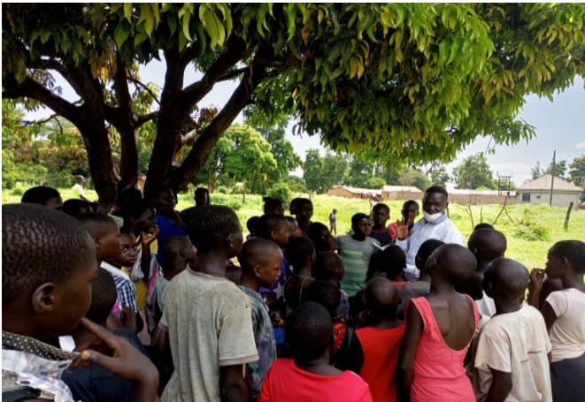
HELPING CHILDRENS IN NORTHERN UGANDA VITAMINS