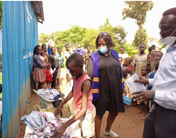
GIVING CLOTHES TO CHILDREN IN LIRA CITY